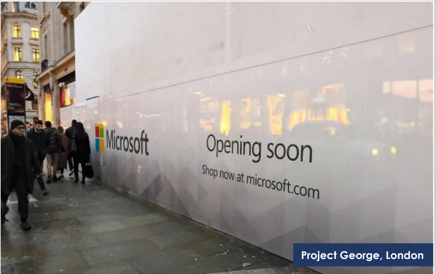
Project George, London

The launch of a famous software firm's flagship UK store at Oxford Circus, London, was shrouded in mystery. Behind the scenes, another installer had removed themselves from the project (codenamed Project George ) leaving the fit-out contractors with a big problem very close to the installation date. MPS stepped in to save the day.